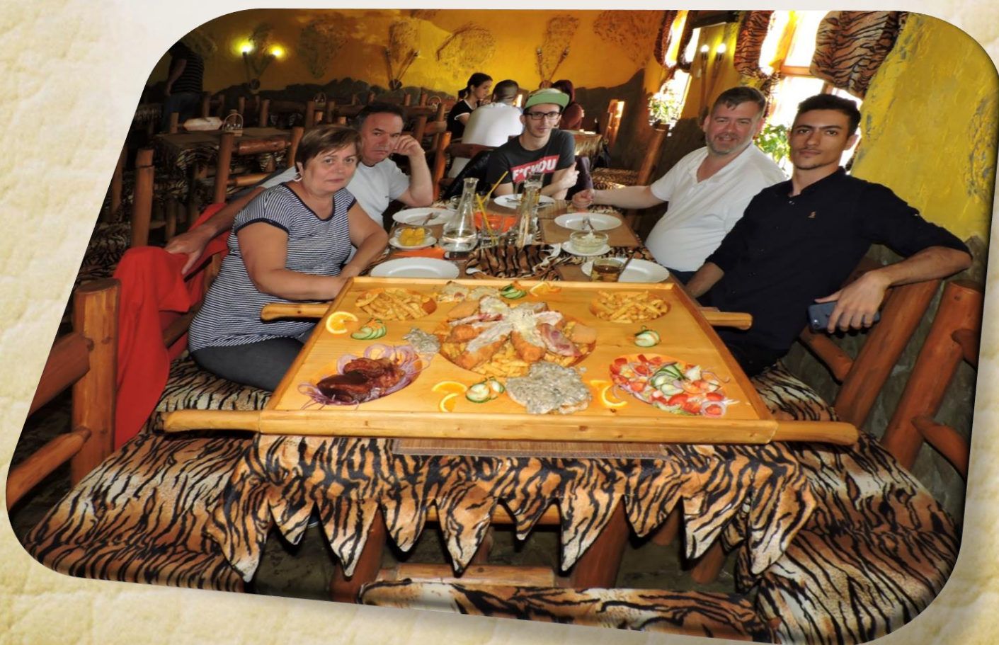
Table reservation: 06-30/752-2203

Address: 3412 Bogács, Ady Endre str. 21.